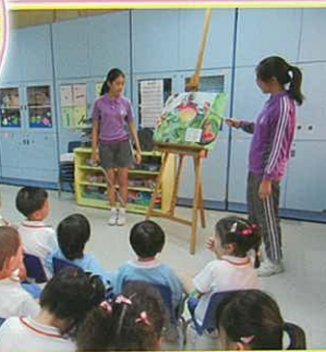
開心果月 Joyful Fruit Day