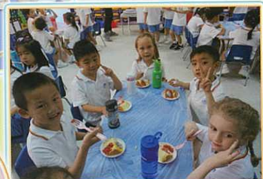
「綠色社區-南丫島」環保同樂日 Lamma Green Fun Day