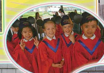
迪士尼畢業慶典 Disney Graduation Day