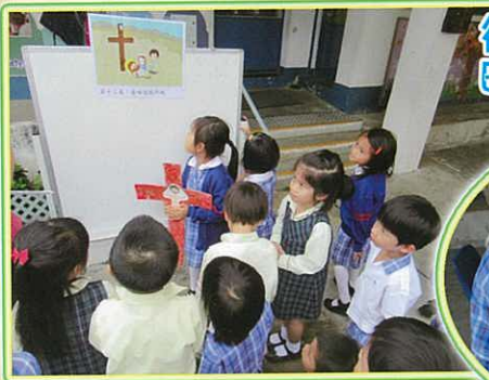
復活節活動 Easter Activities